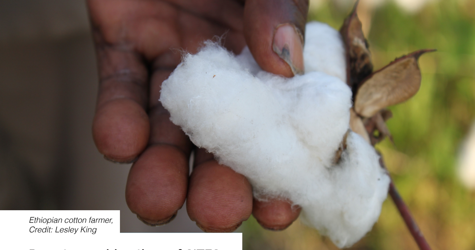
Ethiopian cotton farmer