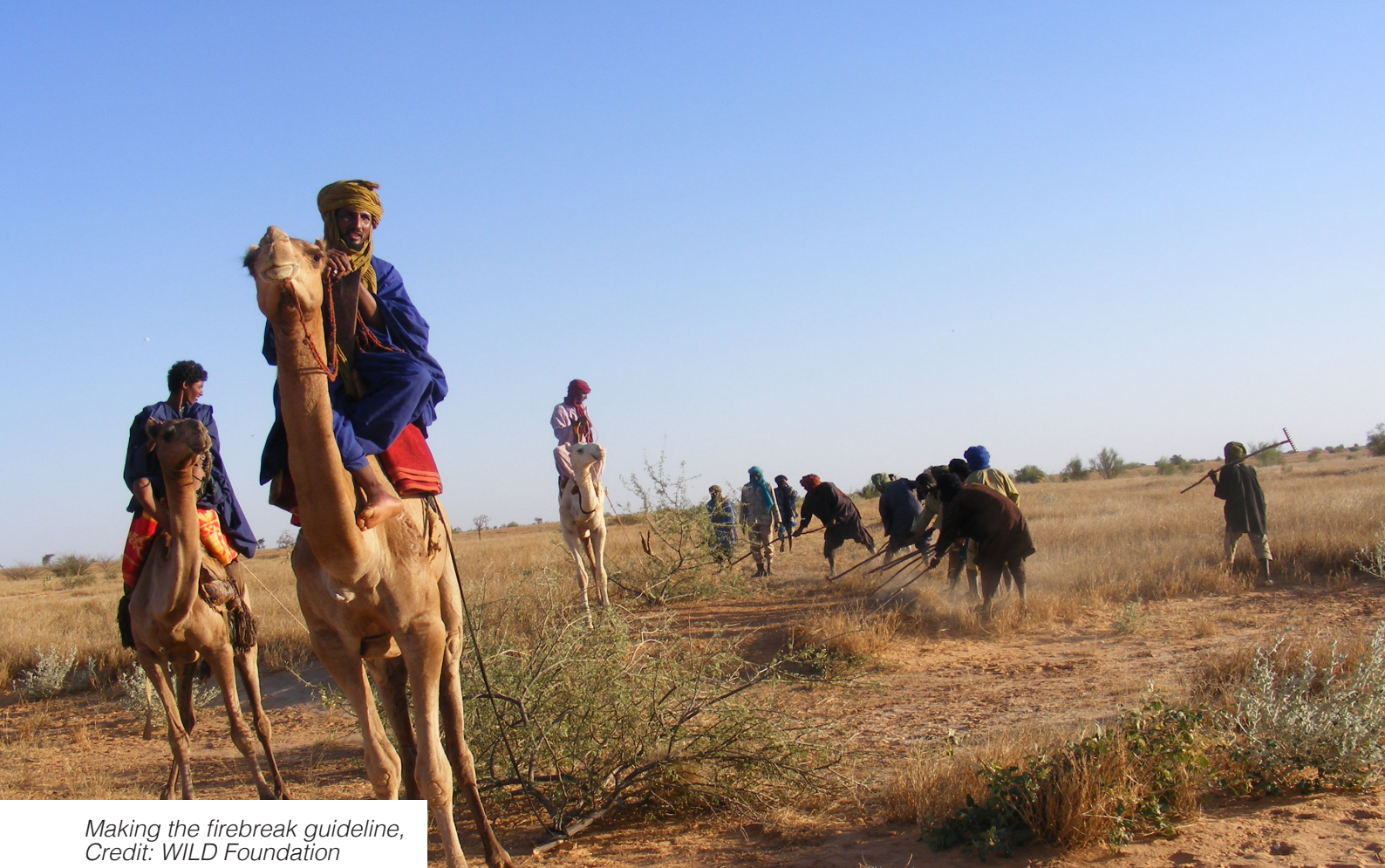
Making the firebreak guideline