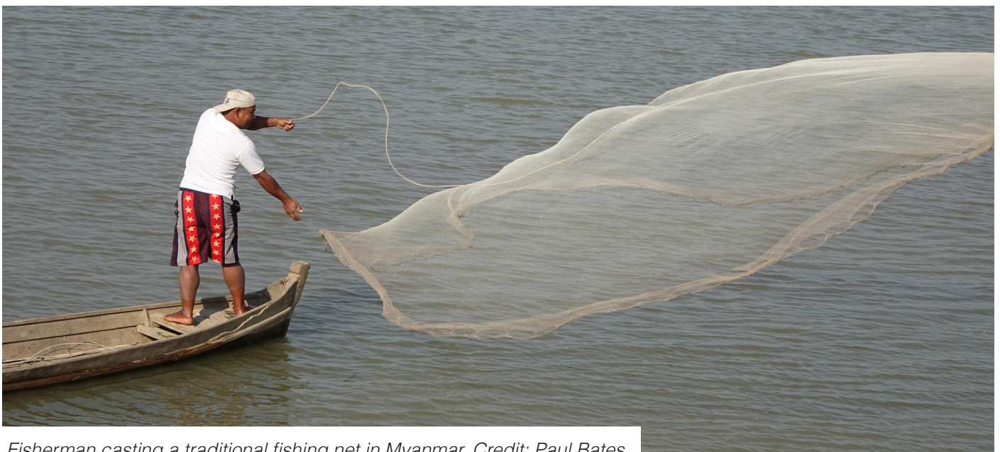
Fisherman casting a traditional fishing net in Myanmar

“ Alternative income generating activities are commonly proposed as a route to poverty reduction while reducing destructive behaviours ”