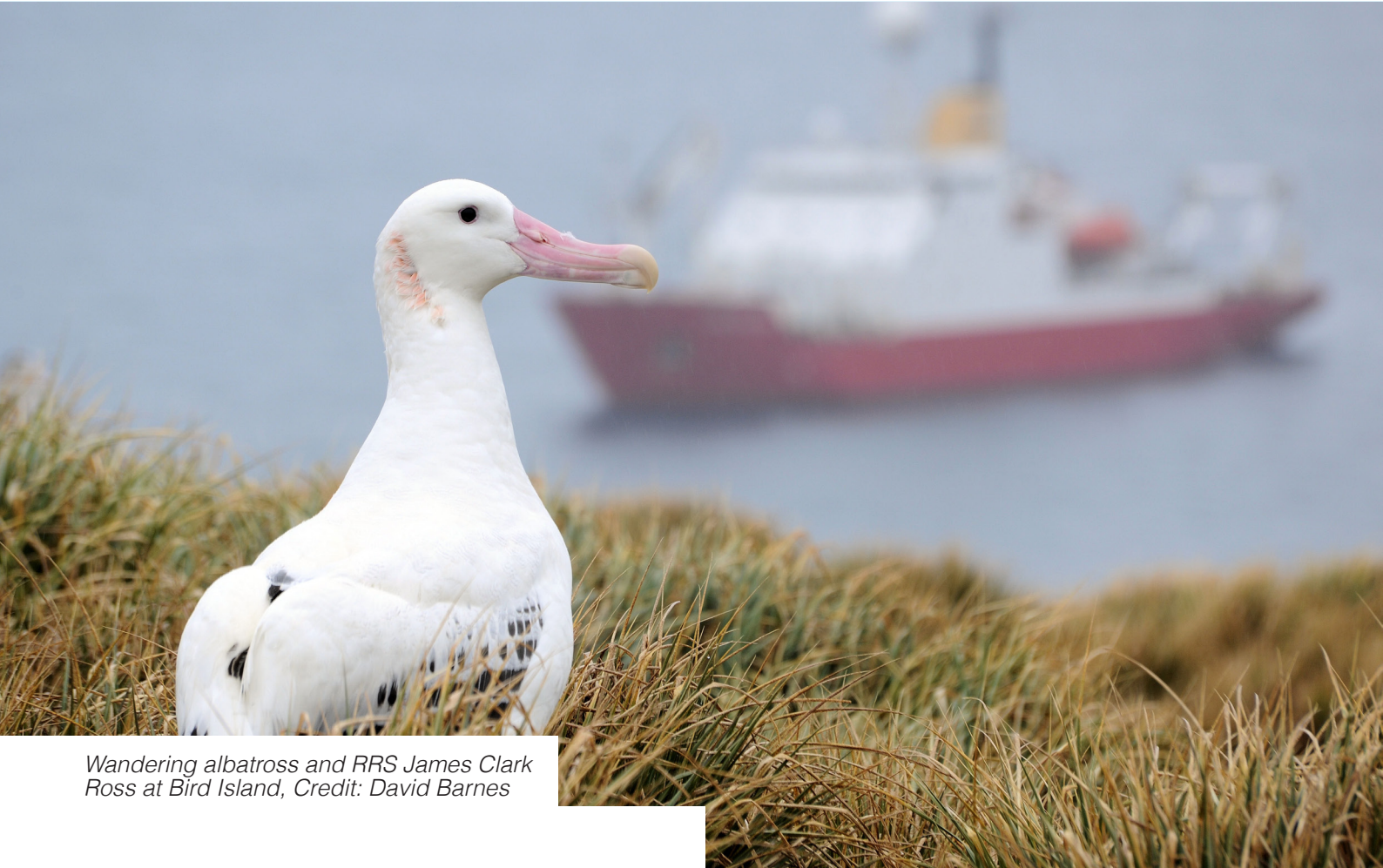
Wandering albatross and RRS James Clark Ross at Bird Island