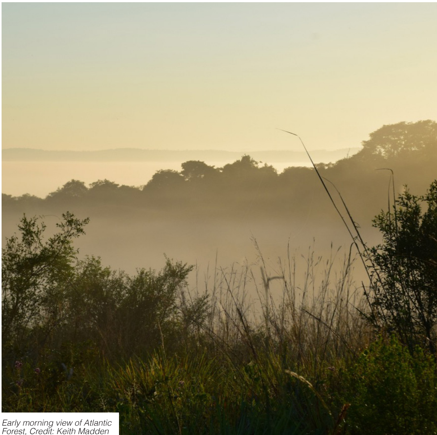
Early morning view of Atlantic Forest