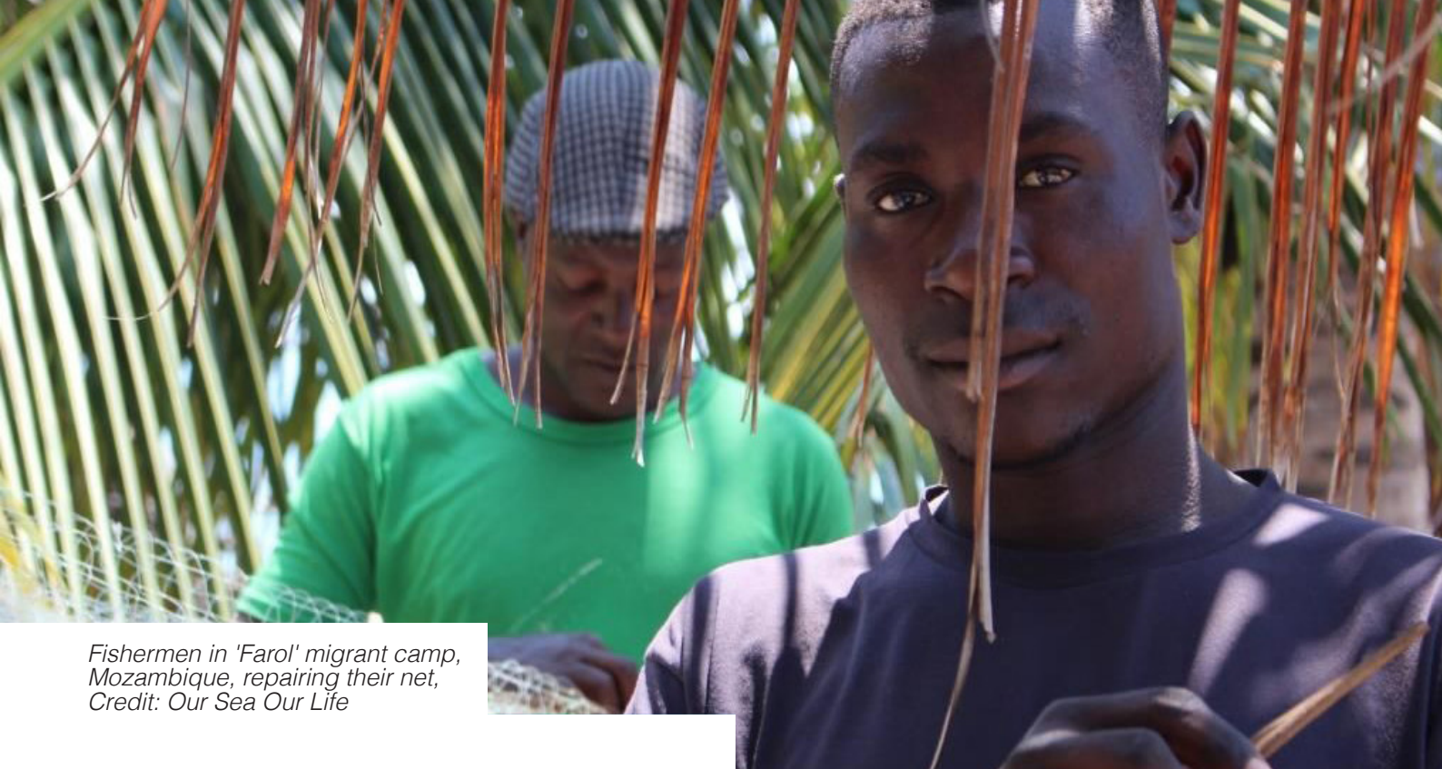
Fishermen in 'Farol' migrant camp, Mozambique, repairing their net, Credit: Our Sea Our Life