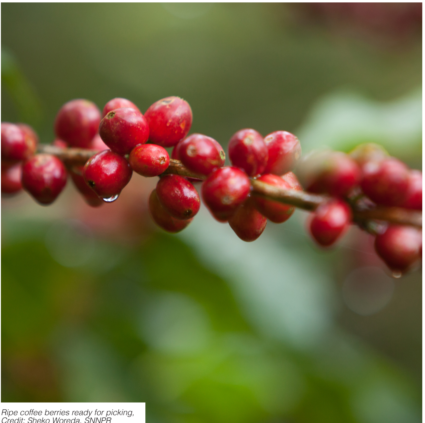
Ripe coffee berries ready for picking, Credit: Sheko Woreda, SNNPR

All Darwin projects must deliver excellent Value for Money. Projects that seek to improve the livelihoods of a small group of people are unlikely to be selected for funding, although there may be exceptions. For example, highly dispersed populations in a challenging landscape or indigenous peoples at high risk may reasonably justify targeting a small number of people. A judgement will be made based on the value of funds requested and the size of the expected impact.