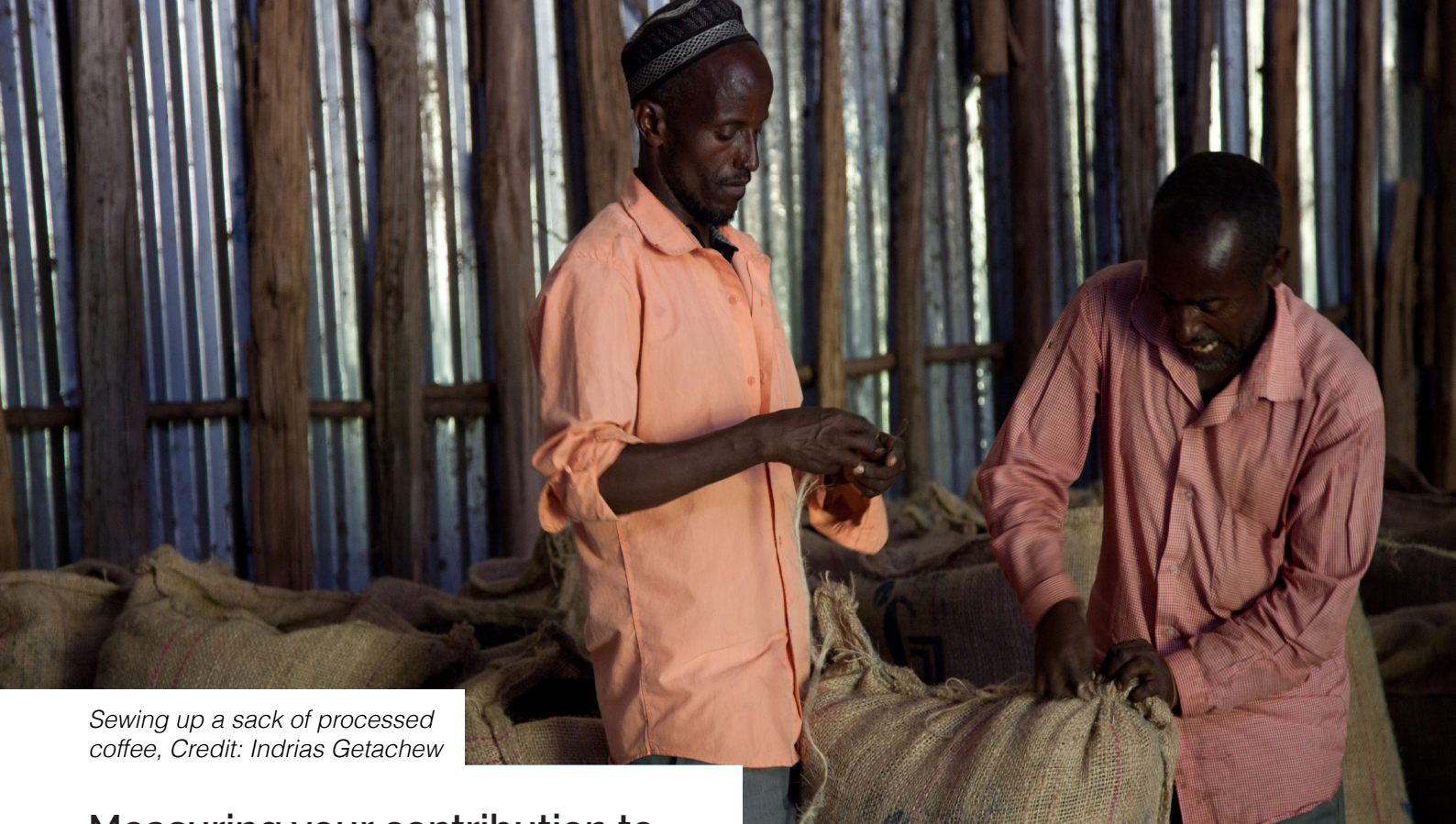
Sewing up a sack of processed coffee, Credit: Indrias Getachew