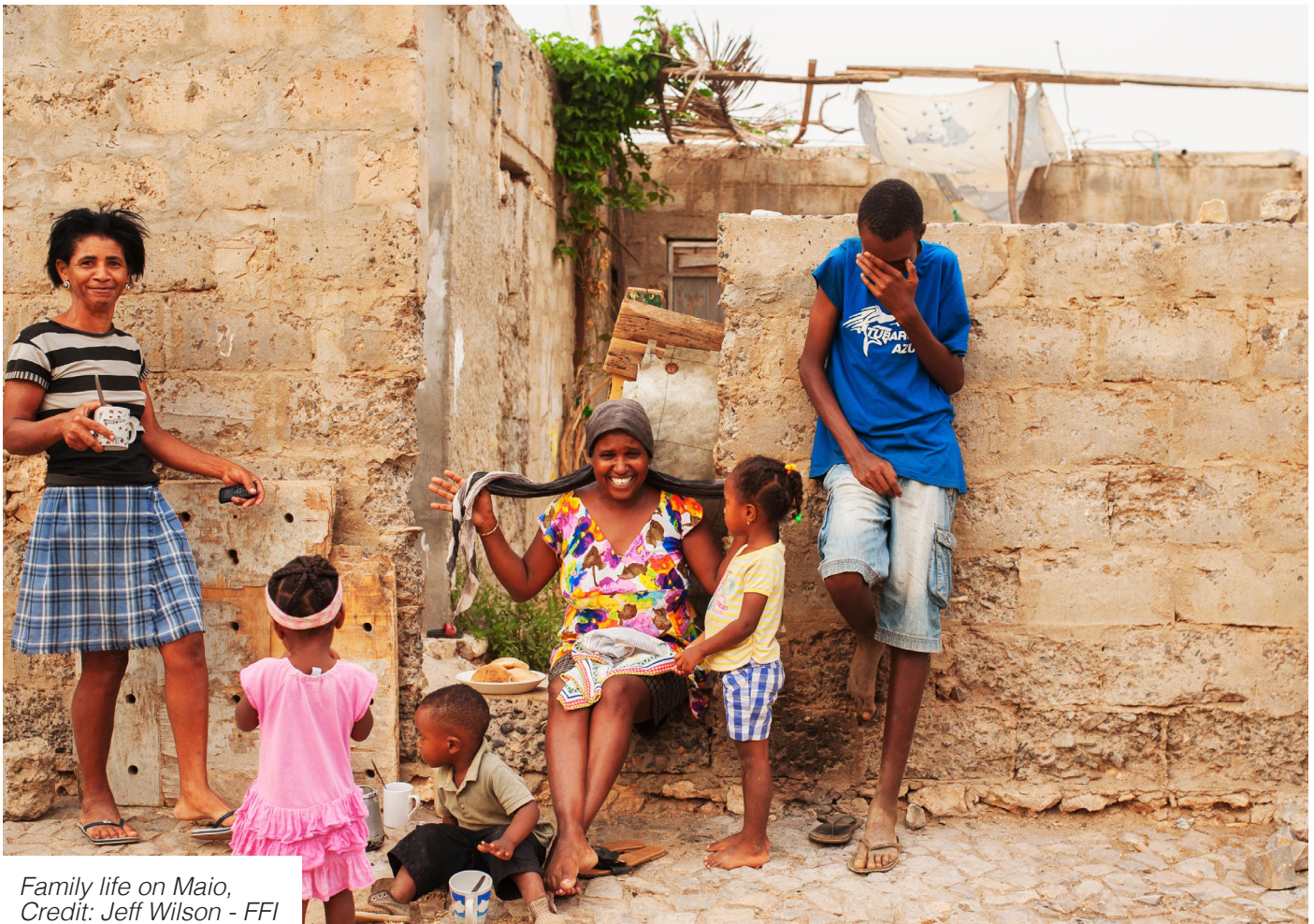
Family life on Maio

Darwin projects by nature comprise partnerships. It is not necessary therefore for the lead organisation to have all the skills required to undertake the project. However, it is essential that there are skills and expertise within the project team capable of undertaking the work outlined. For example, if a project is about generating business plans for local businesses, it is essential that the project proposal can demonstrate (in CVs and the narrative)