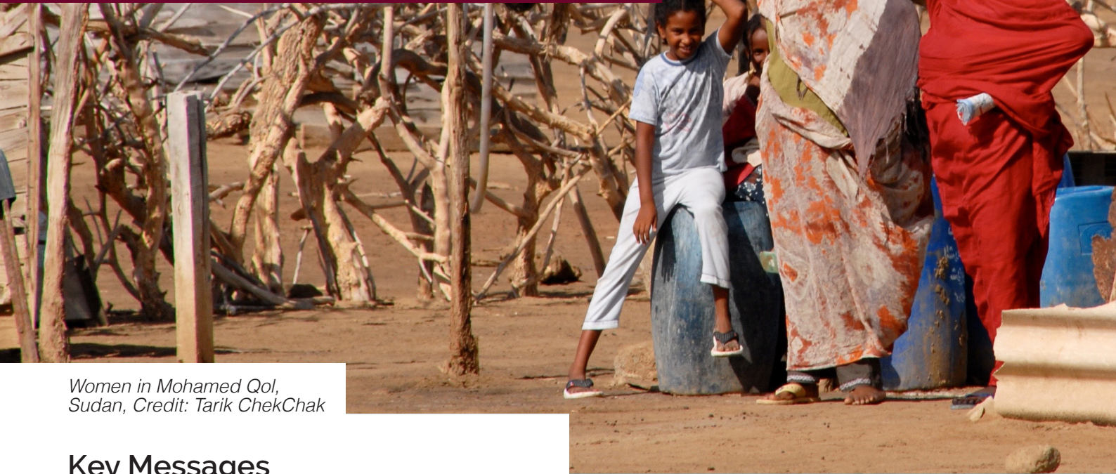
Women in Mohamed Qol, Sudan